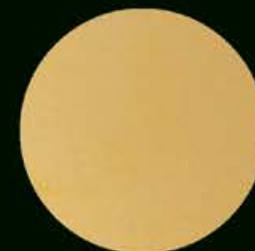
Art. 520 B