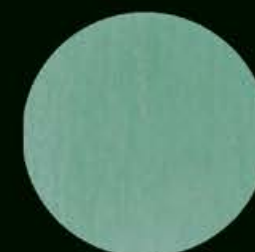
Art. 515 B