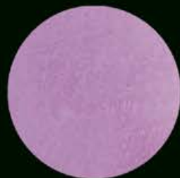
Art. 522 B