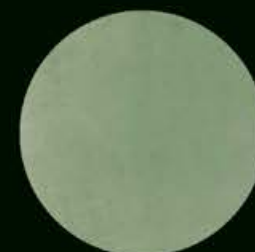
Art. 530 B