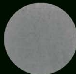
Art. 518 B