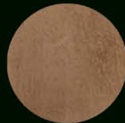
Art. 523 B