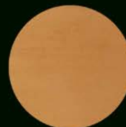
Art. 529 B