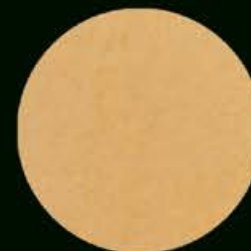
Art. 519 B