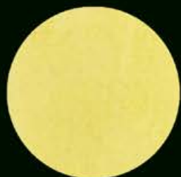
Art. 521 B