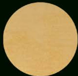
Art. 516 B