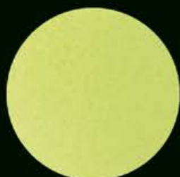
Art. 527 B