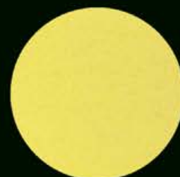
Art. 528 B SPIVER CHANNEL