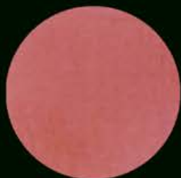
Art. 517 B