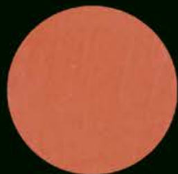
Art. 511 B