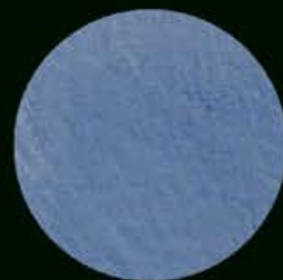
Art. 513 B