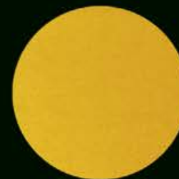
Art. 514 B