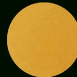
Art. 525 B