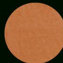
Art. 524 B