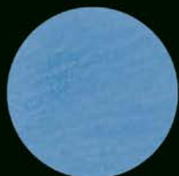
Art. 526 B